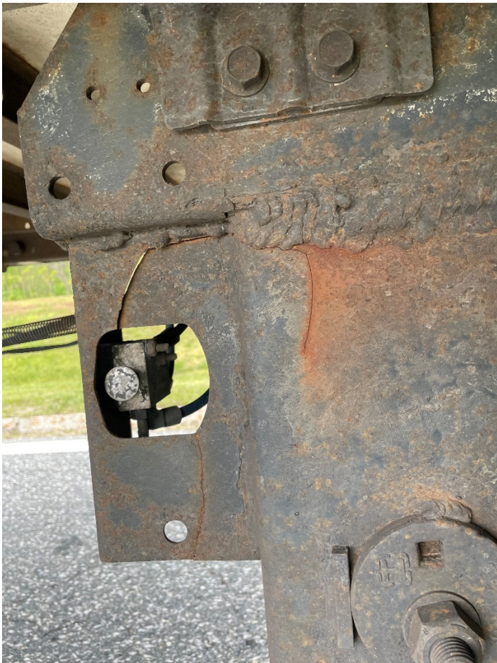
Crack in subframe.