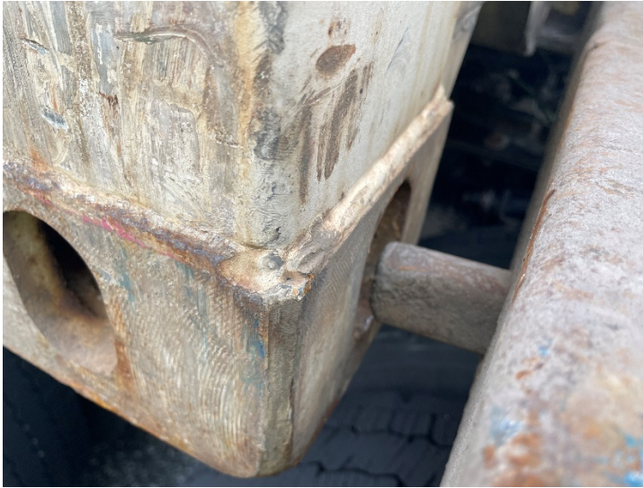
Out of service- improperly secured intermodal container.