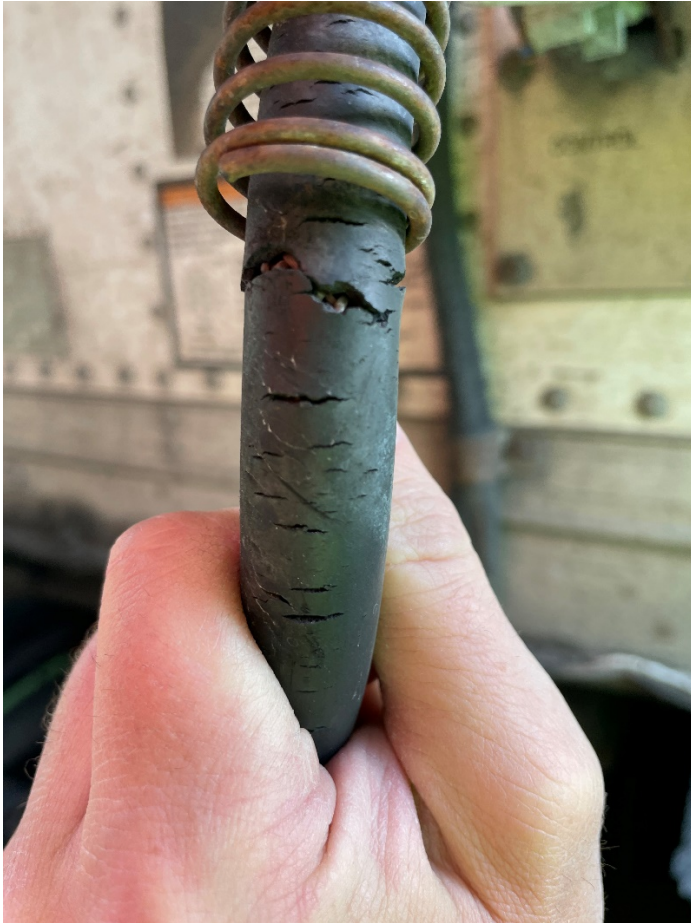
Defective air brake hose.

05/19 Rte 5 Fairlee. An Inspector stopped a household goods mover. The driver was found to have an expired medical card and was over his hours of service.